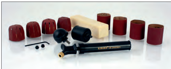
Basic Sanding Kit Art. no. KJ140R140 Hand pump, Inflatable drums KJ140 and KJ140R, 8 Sanding Sleeves, Cleaner.