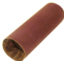
Sleeve to KJ130