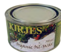
Oil-Wax 300ml KJ909