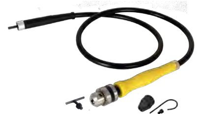
Flexible Shaft. Art. no. KJ202S