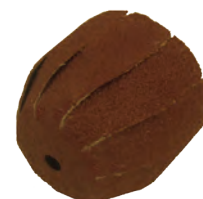
Sleeve to KJ140R