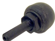
Art. no. KJ120R