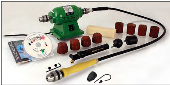
Basic Sanding System Art. no. KJ140K-230 Basic Sanding Kit, Motor, Flexible Shaft, Booklet and DVD.