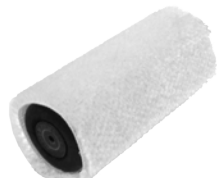
(B) Sleeve to KJ130