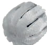
(B) Sleeve to KJ140R