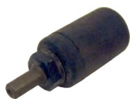
Art. no. KJ120