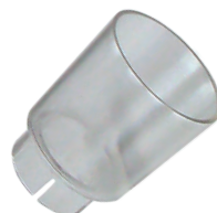
Dust Extendor. Art. no. KJ219