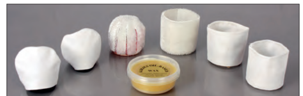
Polishing Kit Art. no. KJ908 2 Brush Sleeves and 4 Cloth Sleeves (fitting KJ140 and KJ140R), Non-toxic Organic Wax.