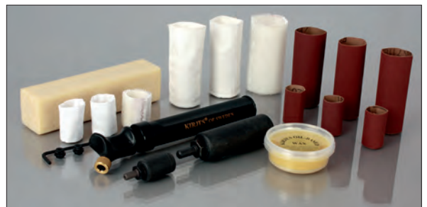
Detailed Sanding & Polishing Kit Art. no. KJ120130P Hand pump, Inflatable drums KJ120 and KJ130, 6 Sanding Sleeves, 6 Cloth Sleeves, Cleaner, Non-toxic Organic Wax.