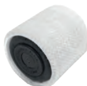
(B) Sleeve to KJ140