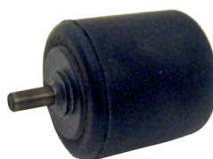
Art. no. KJ140