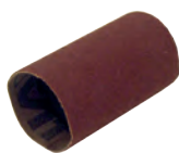
Sleeve to KJ120