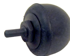
Art. no. KJ140R