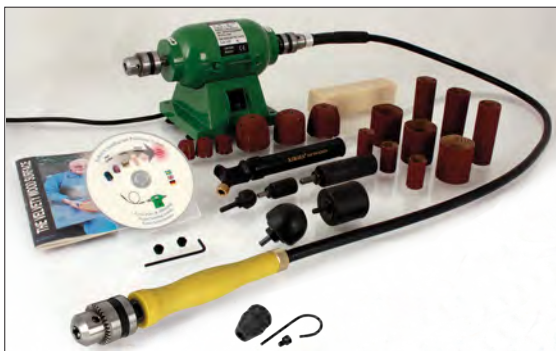
Complete Sanding System Art. no. KJ101K-230 Total Sanding Kit, Motor, Flexible Shaft, Booklet and DVD.