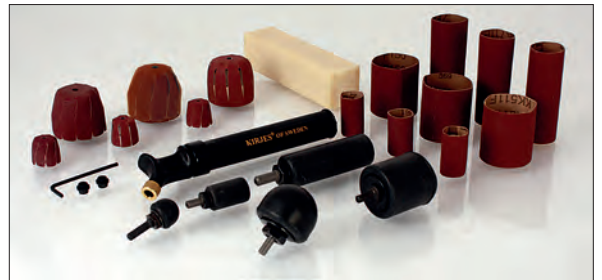
Total Sanding Kit Art. no. KJ101 Hand pump, all 5 Inflatable drums, 15 Sanding Sleeves, Cleaner.