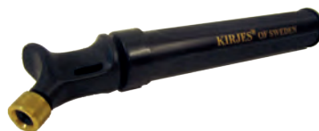
Hand Pump. Art. no. KJ911