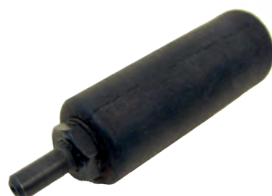
Art. no. KJ130