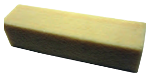
Abrasive Belt Cleaner. Art. no. KJ921

Abrasive belt cleaner, made of natural rubber for effective cleaning of the sanding sleeves.