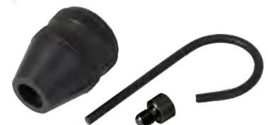
Small Chuck 1,5-8 mm. Art. no. KJ203

Dust Extractor with Extendor, enable dustfree woodworking. The transparent Extendor can be formed according to need. Small Chuck, 1,5-8 mm, is included in KIRJES Flexible Shaft. The smaller overall size makes the work easier.