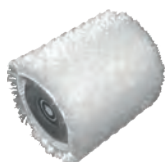
(B) Sleeve to KJ120