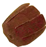
Sleeve to KJ120R