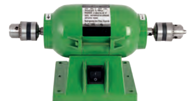
Motor. Art. no. KJ913K-230

Technical info: 300 W, 3000 rpm, extremely quiet. Height: 150 mm. Total length: 300 mm. Weight: 4,5 kg. With two tapered key-chucks = vibration-free running. Chucks: 1,5-10 mm.