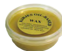
Oil-Wax 50ml KJ907